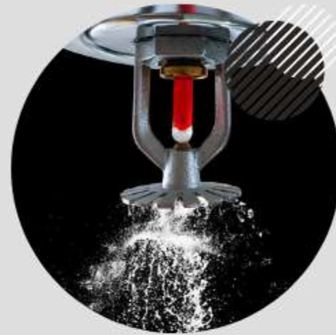
Water Sprinkler System