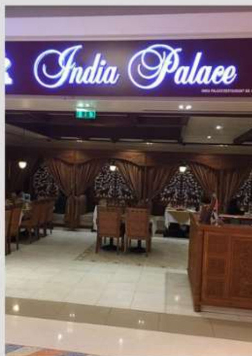
Indian Palace Hotels