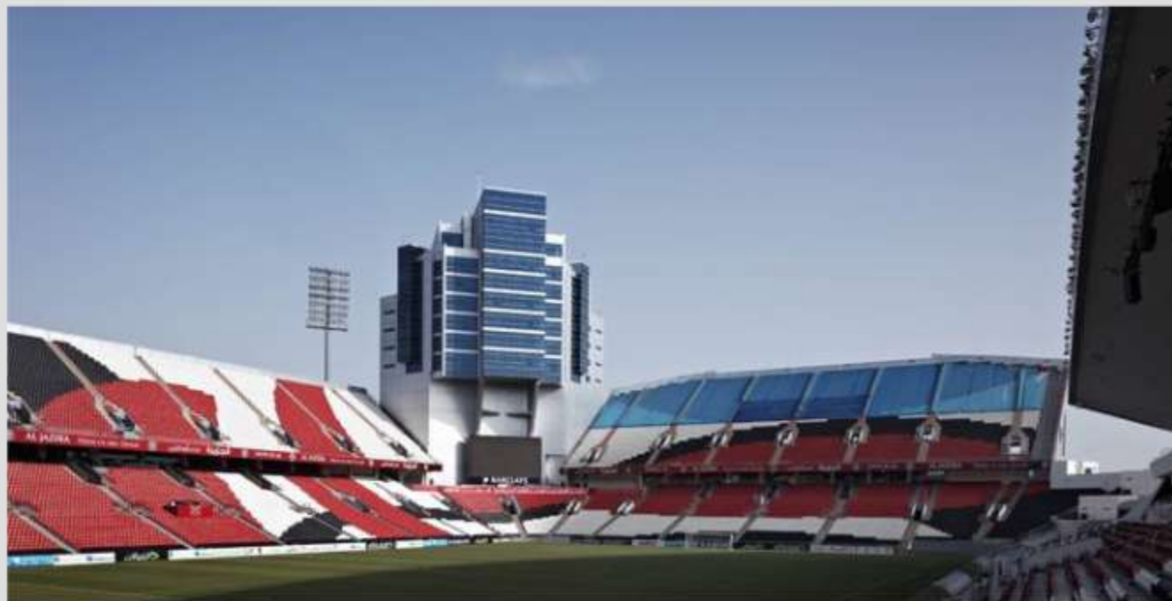
Jazira Sports Club