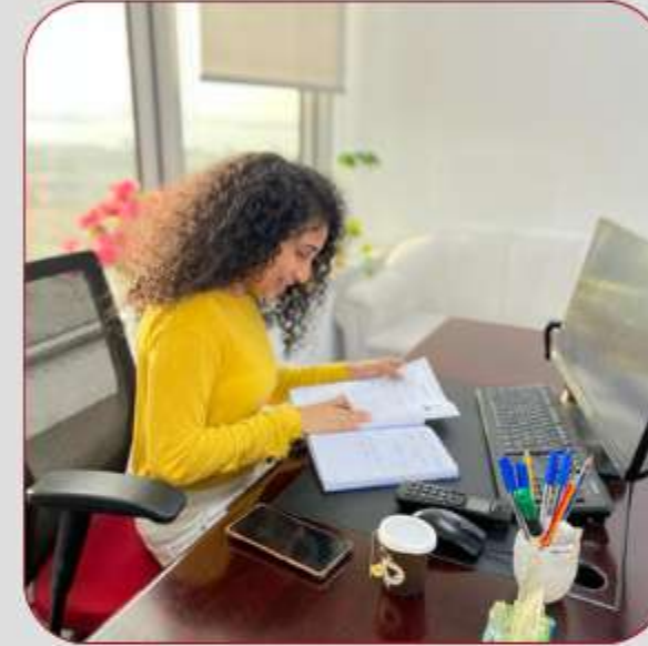
MANAGER -ESR DIVISION