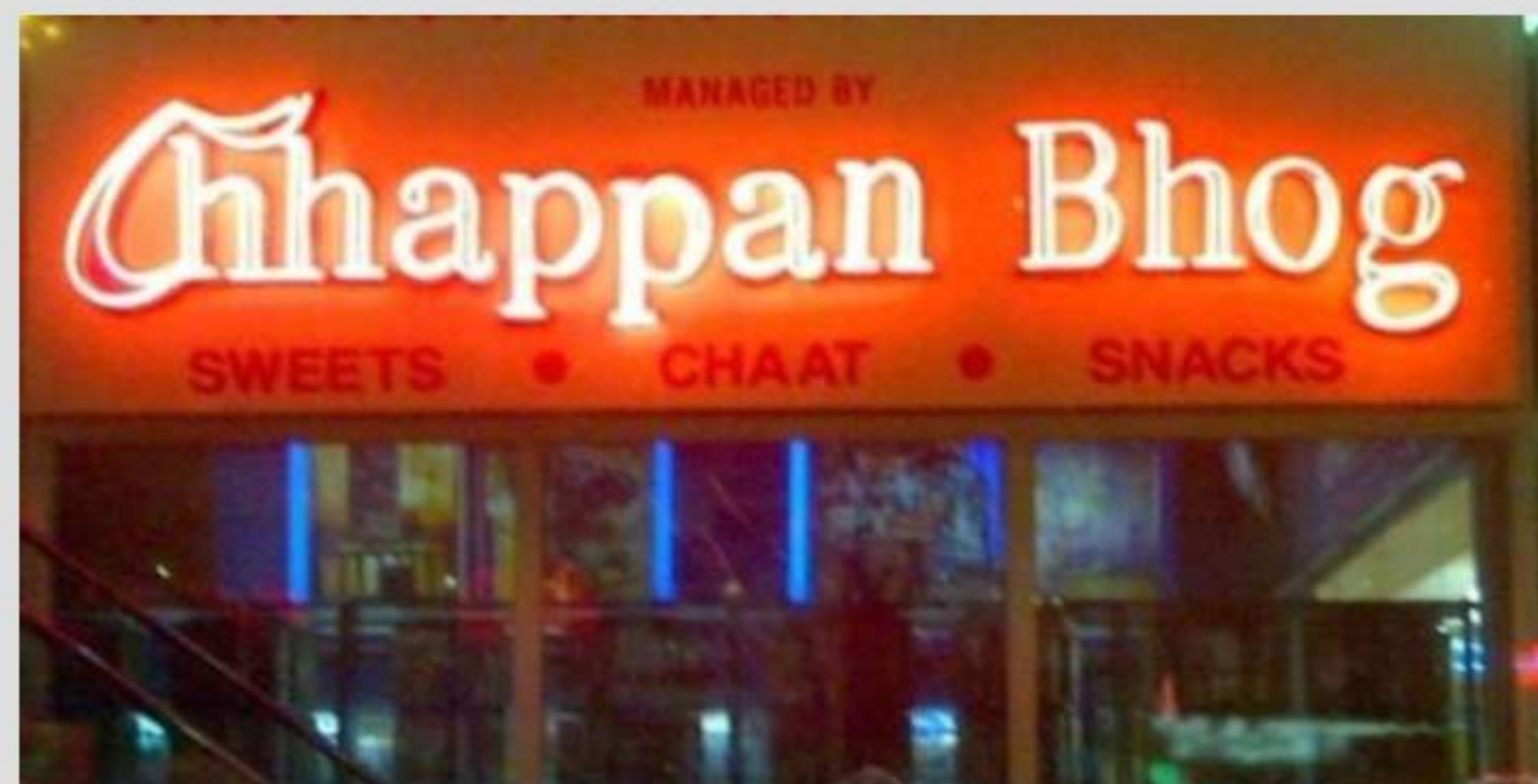
Chappan Bhog Restaurants