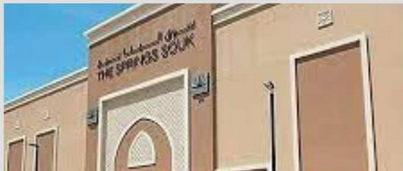
Springs Souk Mall