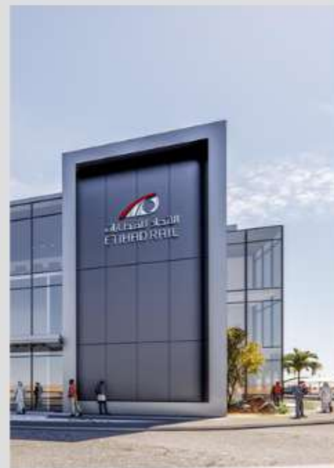
Etihad Railway HQ