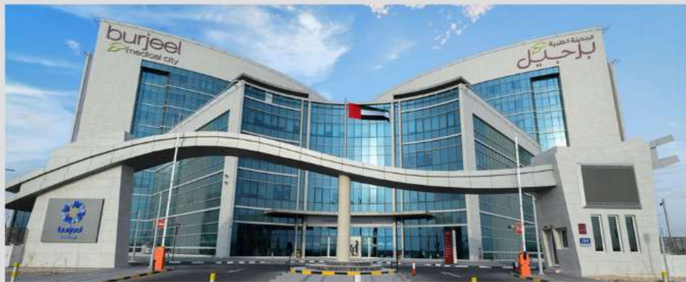
Burjeel Medical City