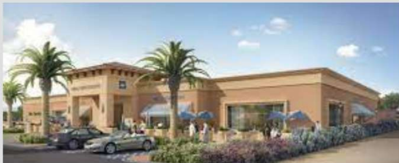
Mira Town Center Mall