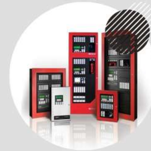
Voice Evacuation System