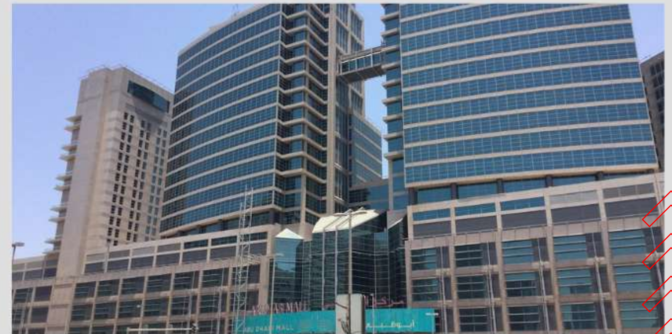
Abu Dhabi Mall