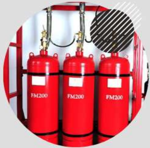
FM200 A Clean Agent