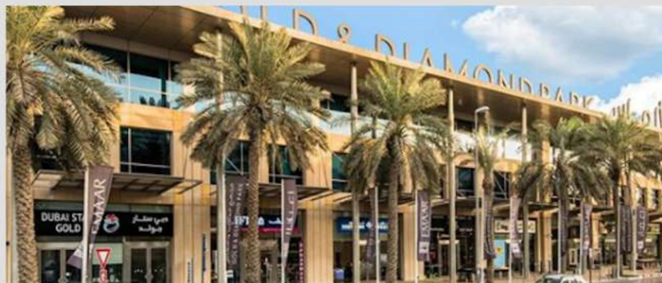
Gold & Diamond Park