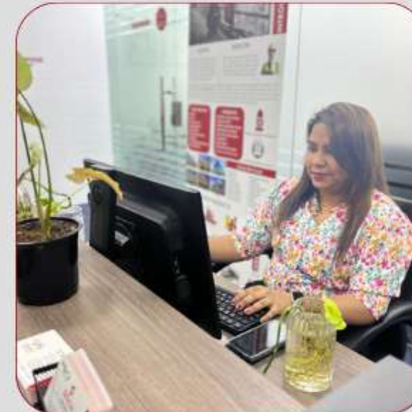
MANAGER- ITC DIVISION