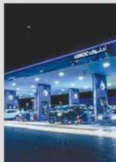
ADNOC Service Station