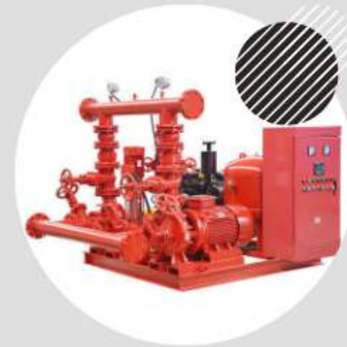
FM Approved UI Listed Fire Pumps