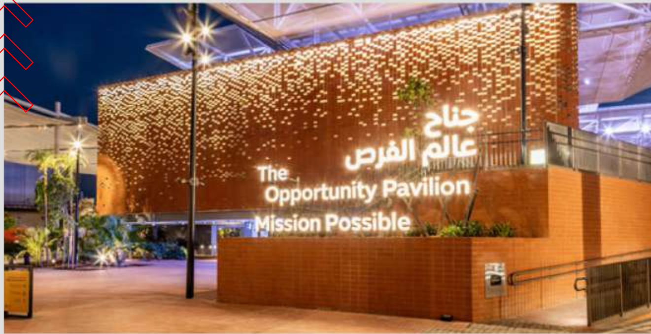
Expo Opportunity Pavilion