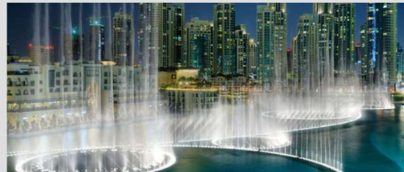
Dubai Mall Fountain