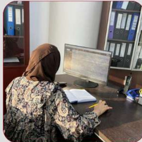
HUMAN RESOURCE ADMINISTRATOR