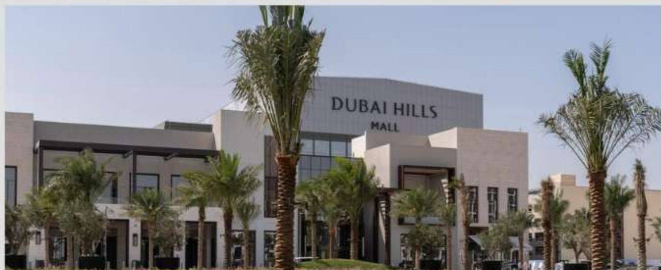
Dubai Hills Mall